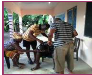
Patient with head wound

And patients keep on coming to the new Hope Homeopathy Health Clinic , often queuing for treatment for both acute and chronic health issues, so training more homeopaths is crucial.